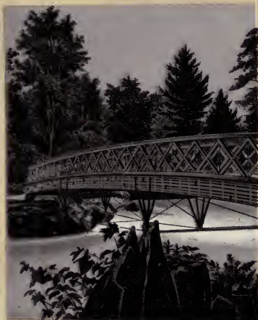
SECOND SISTERS ISLAND BRIDGE.