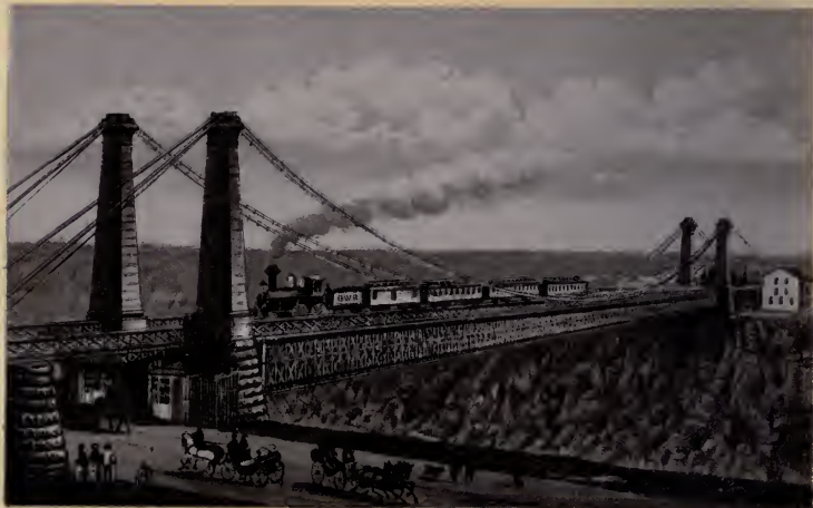
GREAT WESTERN RAILWAY SUSPENSION BRIDGE