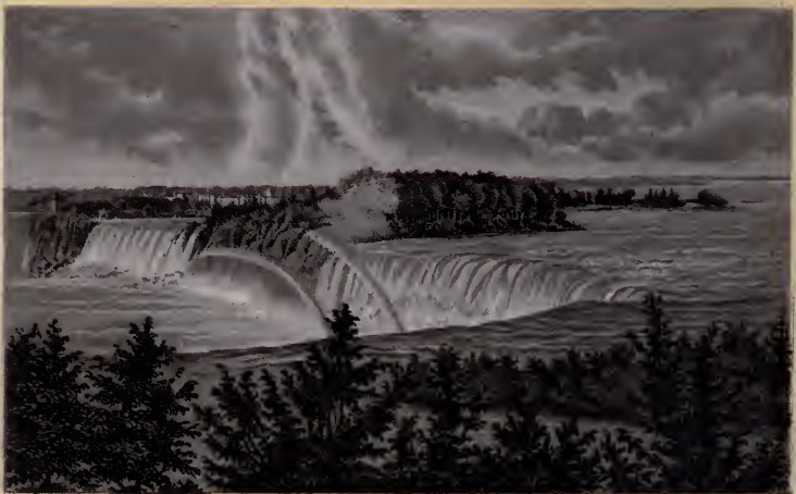
BOTH FALLS FROM CANADA.