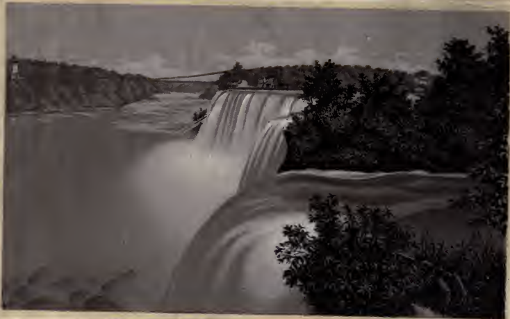
AMERICAN FALLS FROM GOAT ISLAND.