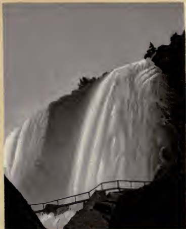
WHIRLWIND BRIDGE, AM. FALLS