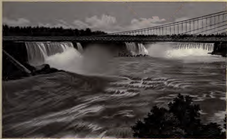
BOTH FALLS FROM BELOW SUSPENSION BRIDGE.