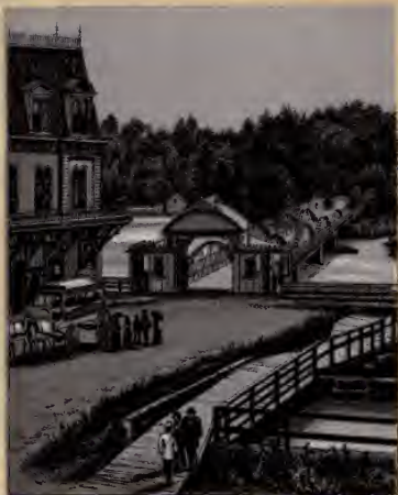
GOAT ISLAND BRIDGE.