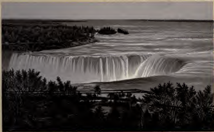
HORSESHOE FALL & THREE SISTERS ISLANDS, FROM CANADA.