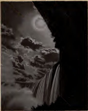
HORSESHOE FALL BY MOON LIGHT.