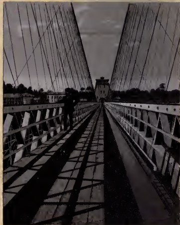
ROADWAY OF SUSPENSION BRIDGE.