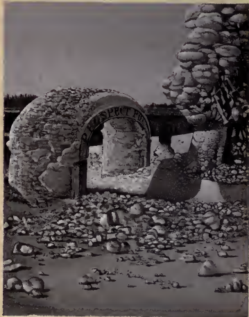
WINTER SCENE IN PROSPECT PARK