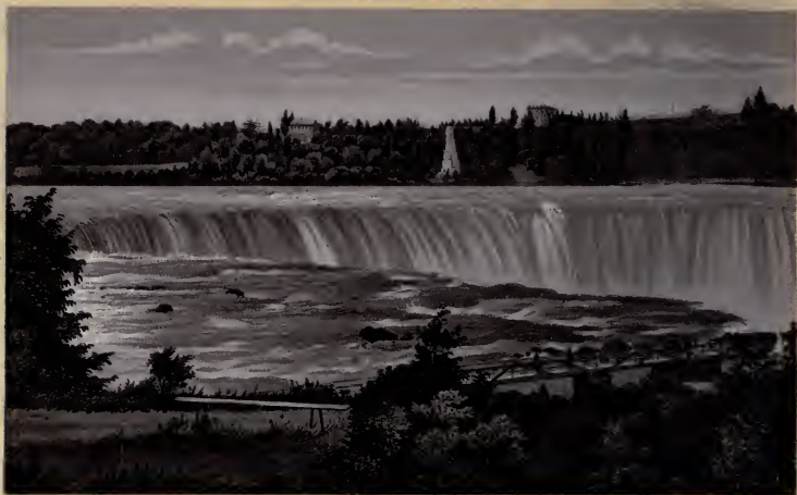
HORSESHOE FALL FROM GOAT ISLAND.