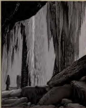
BIDDLE'S STAIRS IN WINTER.