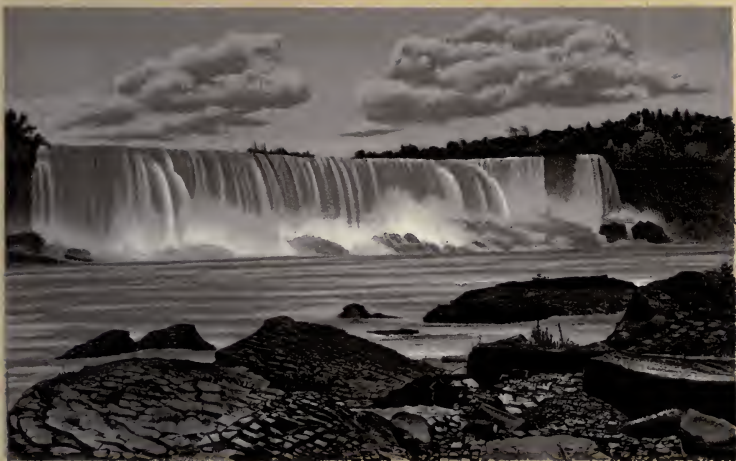
AMERICAN FALLS FROM CANADA SHORE.