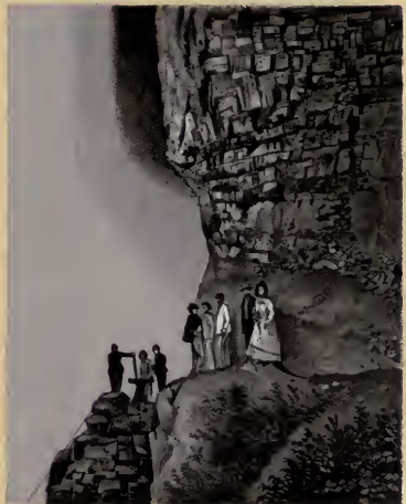
ENTRANCE TO CAVE OF THE WINDS.