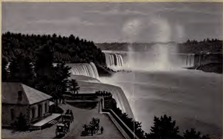
VIEW FROM PROSPECT POINT.