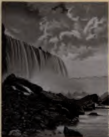
AT FOOT OF HORSESHOE FALL.