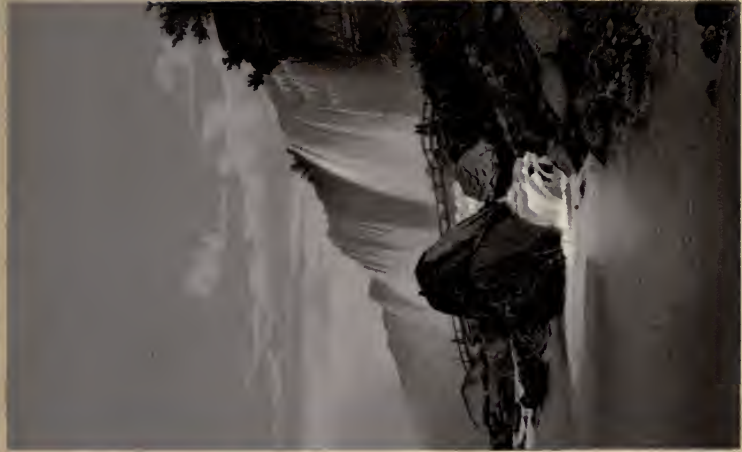
ROCK OF AGES AND CAVE OF THE WINDS - AMERICAN FALLS.