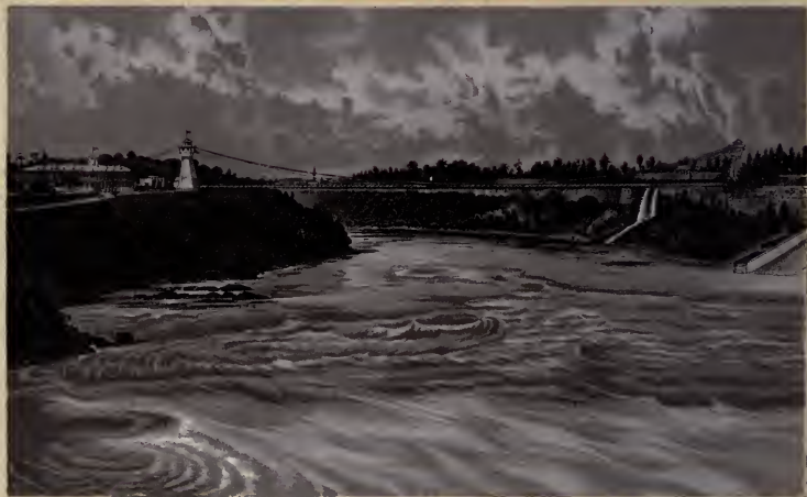
SUSPENSION BRIDGE, LOOKING DOWN RIVER.