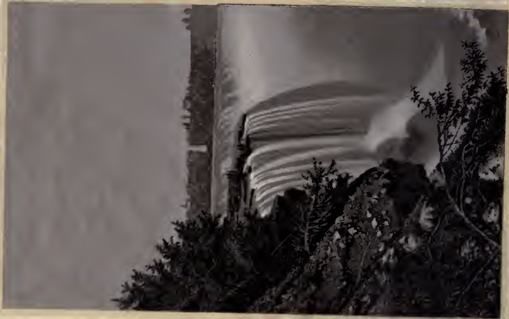
HORSE SHOE FALL FROM GOAT ISLAND.