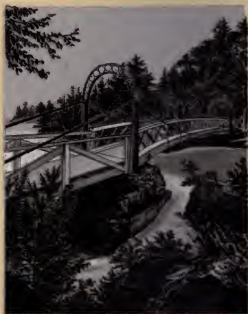
THIRD SISTERS ISLAND BRIDGE.