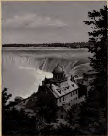
BIRD'S EYE VIEW OF HORSESHOE FALL.