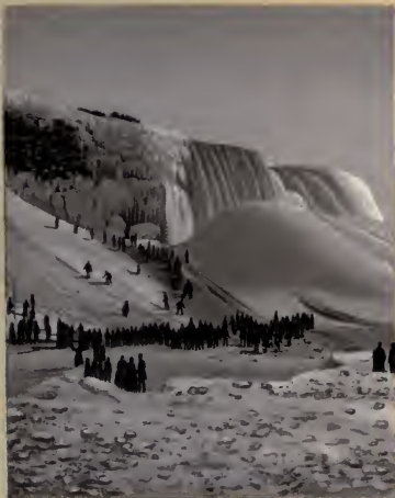
ICE MOUNTAIN IN FRONT OF AM. FALLS.