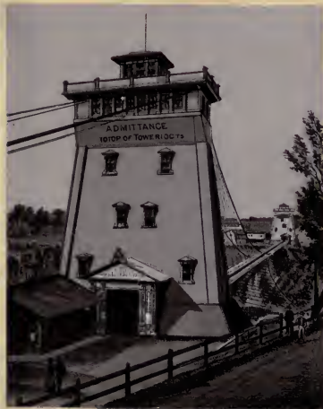
TOWER AND ENTRANCE .