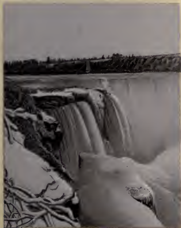
HORSESHOE FALL IN WINTER.