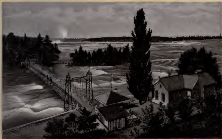
CLARK ISLAND BRIDGE & BURNING SPRING.