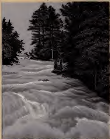
RAPIDS, FIRST SISTERS ISLAND.