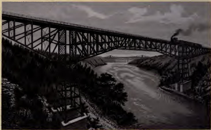
CANADA SOUTHERN RAILWAY CANTILEVER BRIDGE.