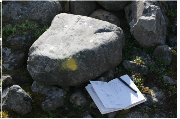
Yellow paint on rocks at location 2. Lichens of interest are almost always solitary and on the flattest part of the rock... not on same side as paint.