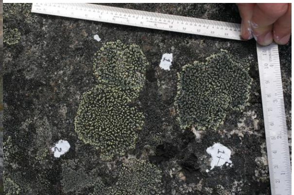
Location 1: Very large lichens on Bologna Gl. moraines are right behind the person. Photos are ideally shot at 200 ISO, no flash and High Resolution RAW. Check that focus is sharp no blur and sharp on the lichen not just the rulers. Please use mid length lens (e.g., 60mm) not wide angle.