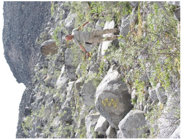
Yellow arrow and paint on granite at location 3. Would like photos to cover about 20cm wide and include two rulers.