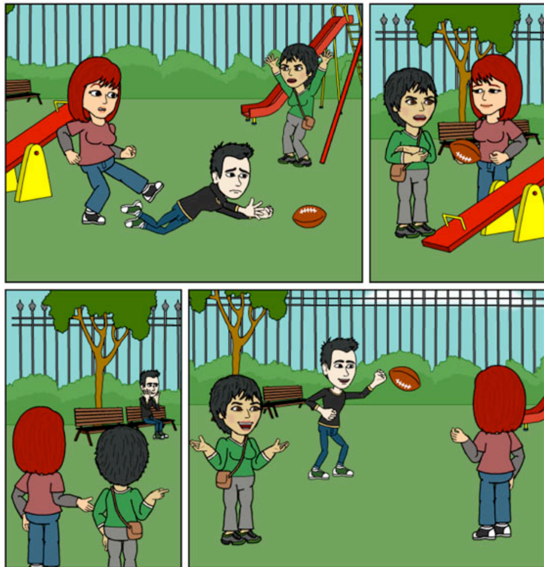
Figure 4.2. Bully Cycle Playground Scenario

The program allows students to manipulate the stance of each avatar along with their gestures and facial expressions to help display emotions for each of the characters involved in their scenario. This helps build empathy for each character in the bully cycle.