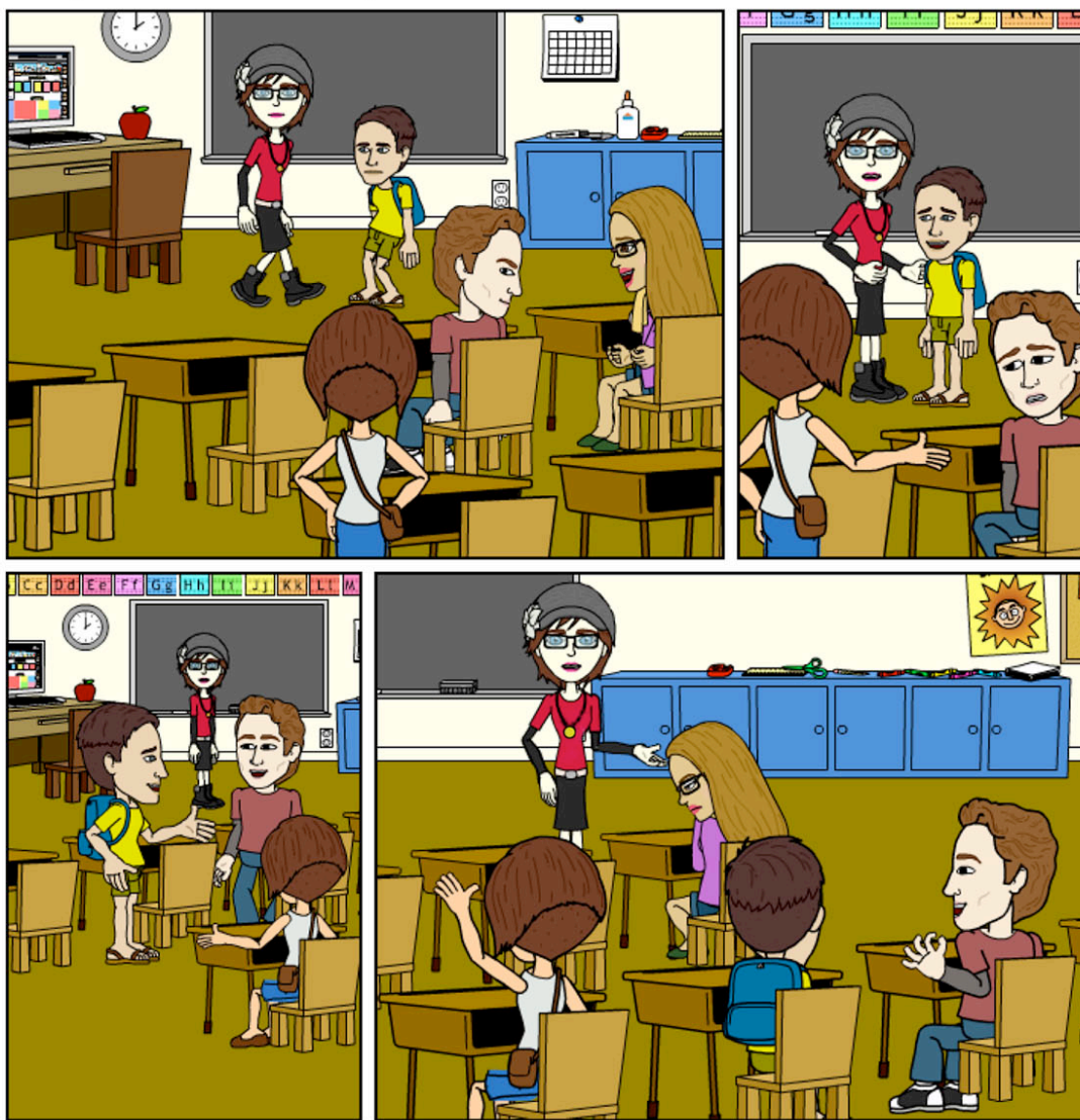
Figure X. Characters and scenes were created by the author, Kate Dirks for the purposes of this handbook, using the comic creation program available free to all Ontario Teachers at www.bitstripforschools.com

Figures 4.2 and 4.3 may be reproduced for classroom use