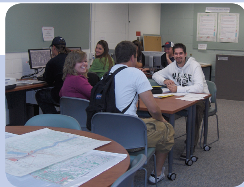
View of the East Wing

Contact Map Library staff at ext. 5890, email maplib@brocku.ca , or drop by for a look.