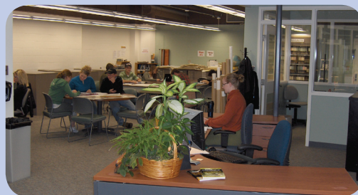
View of the West Wing