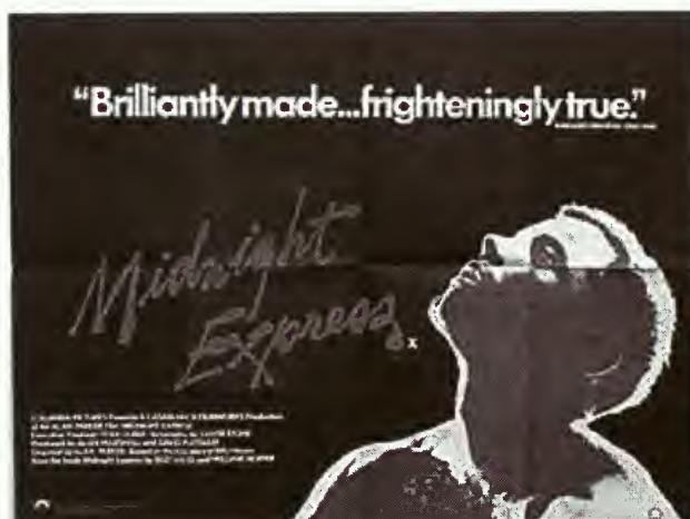
Figure 3. Poster in English for Midnight Express .