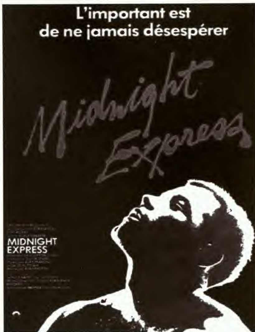
Figure 2. Poster in French for Midnight Express . http://movieartofsweden.com/images/3210_picture.jpeg